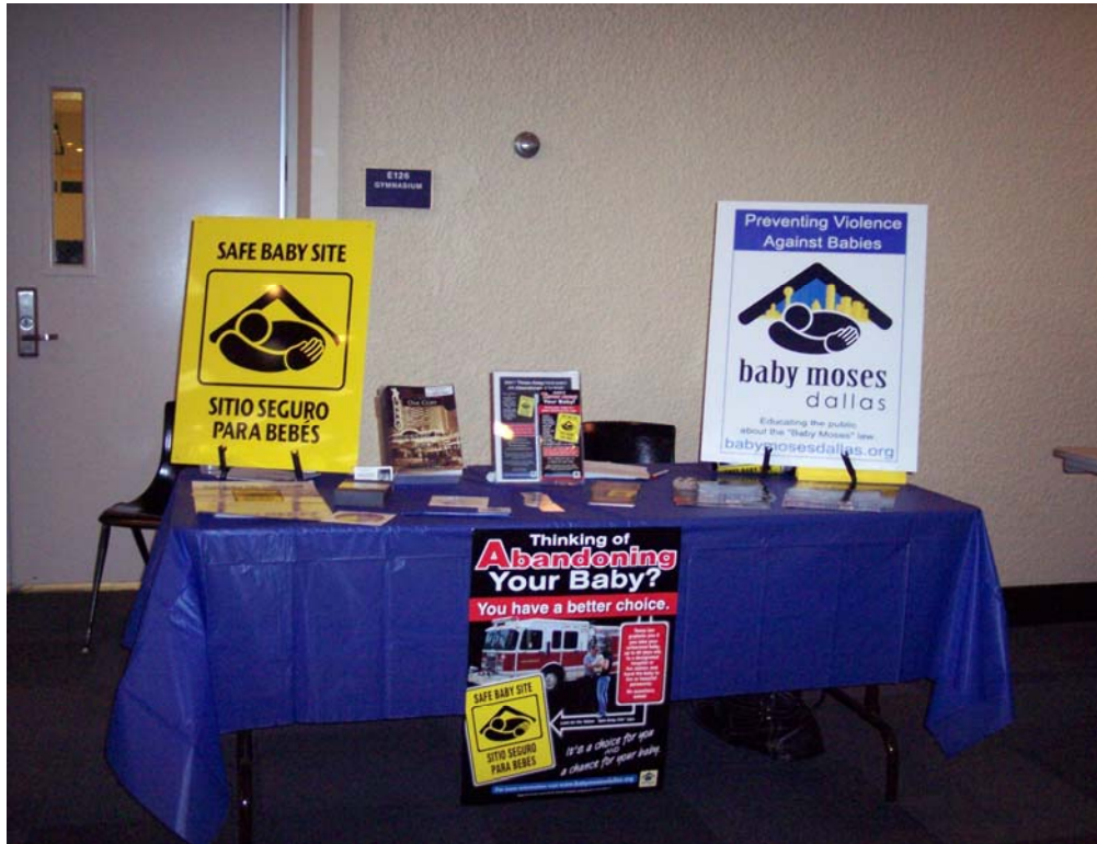
Display at the 2010 Mountain View College Employees Wellness Fair.